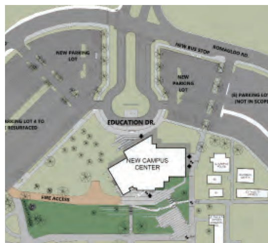
ABOVE: Site Plan for the future Campus Center on the San Luis Obispo Campus.

BELOW: Preschool playground at the new Children's Center in Paso Robles, equipped with swings, play structure, and slides built-in to the grassy slope.