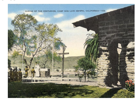
Shrine of the Centurion at Camp San Luis Obispo

1963 - Present: In 1963, residents voted to create a community college district and the adobe became part of the new Cuesta College. In 1970, the adobe was named a Point of Local Interest by the State Historic Preservation Office. In 1973, the adobe opened as a museum housing Native American exhibits until disaster struck. The San Simeon earthquake of 2003 damaged the adobe to the extent that it was no longer safe to enter.