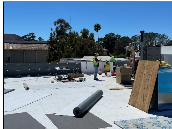
New Roof and HVAC Installation

Re-roofing and HVAC replacement occurred on the 2500, 4000, 6100, 6300, 7100, and 9100 buildings. All new single-ply roofing, HVAC equipment, ductwork, roof drains, exhaust fans, and controls were installed at each location. In the 3 rd issuance, the roofing and HVAC equipment for the 5000s complex will also be replaced.