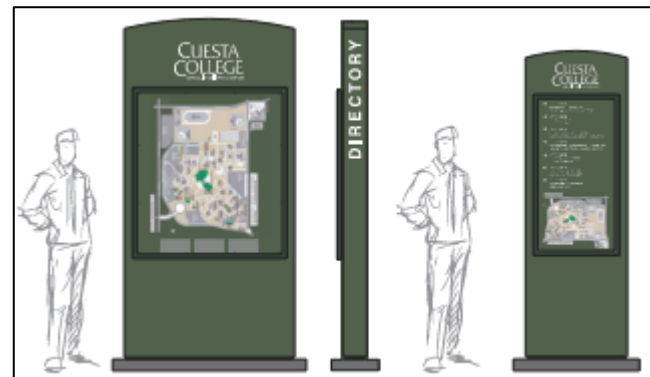
Directory and Directional Kiosks

BOTTOM: 19six Architects' rendering of new North County Instructional Building