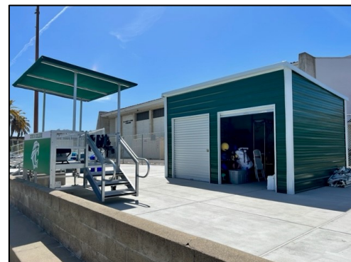
TOP: New Bleachers BOTTOM: Pool Deck Storage Shed