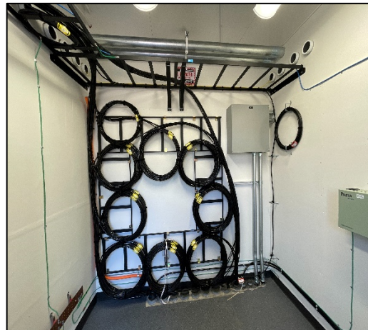
TOP: AV mock-up room 4113 on the SLO campus.