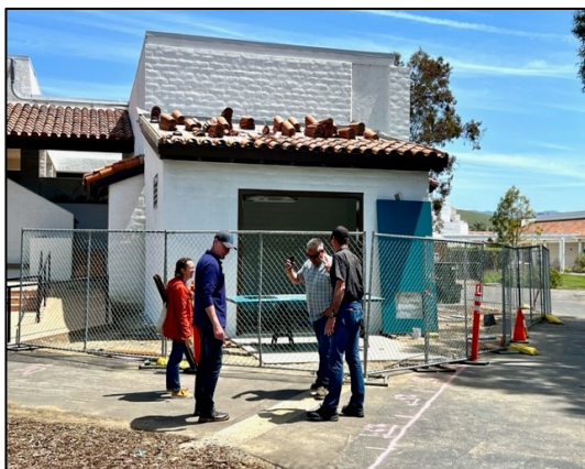
New Enclosure for 6000 Complex Switchgear

The electrical switchgear serving the 5000s and 6000s complexes are nearing the end of life and in the process of being replaced. This work began in the Fall of 2022 and is approaching substantial completion. Due to equipment lead times, this project is being executed in two phases. The first phase will prepare for the new switchgear, while the second will consist of the actual equipment installation. This installation is planned for Winter break 2023. The electrical switchgear for the 4000s complex will also be replaced. This project is currently in design and will be submitted to the Division of State Architect (DSA) in the upcoming months.