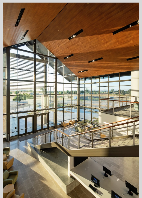
Second story view through the Campus Center main entrance with lobby and student facing computer stations below.