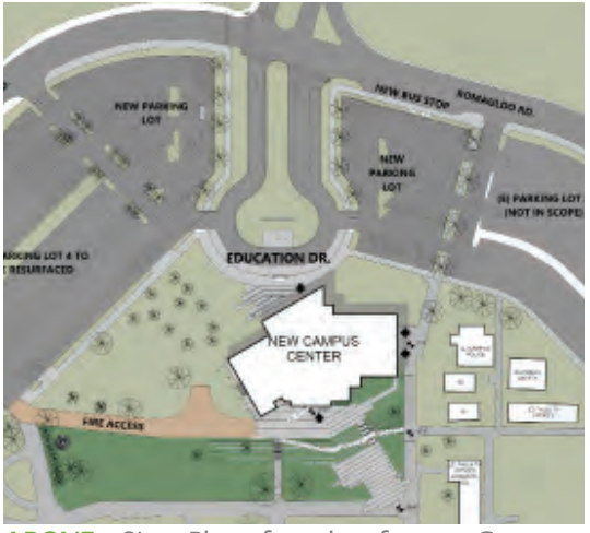
ABOVE: Site Plan for the future Campus Center on the San Luis Obispo Campus.

BELOW: Preschool playground at the new Children's Center in Paso Robles, equipped with swings, play structure, and slides built-in to the grassy slope.